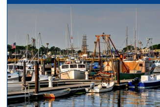
Historic Gloucester "America's Oldest Seaport"