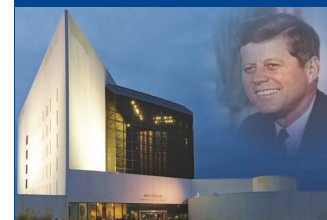
JFK Library & Museum