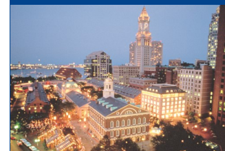
Faneuil Hall Marketplace